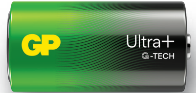
Model No.: GP14AUP

This specification is applicable to GP Ultra Plus Alkaline Cell, GP14AUP (No mercury added).